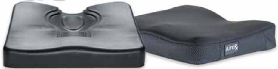
Anatomically Intelligent Design (Shown above with AireFlow™ cover and insert removed.)