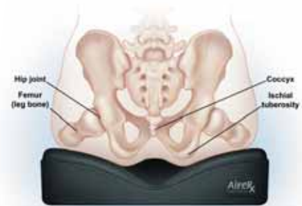
Anatomically Intelligent Design